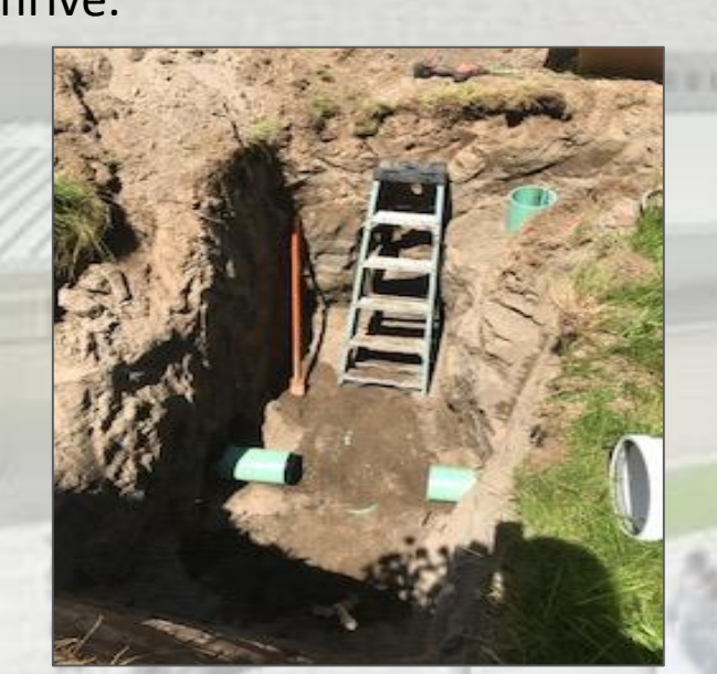
Preparing utilities 8 feet down