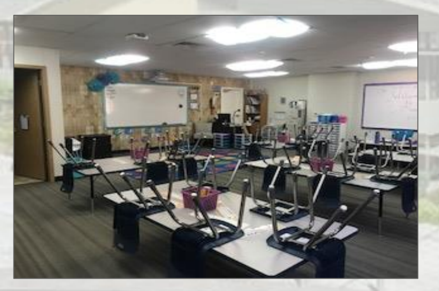
Portable 4 set up and ready for kids!! Great job Amy!