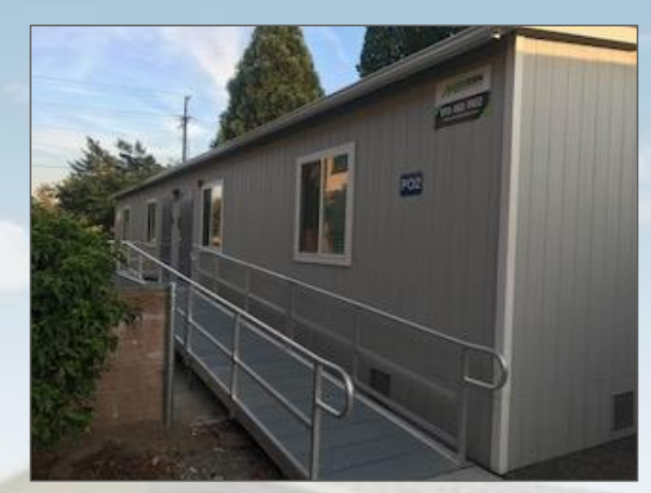
Portable classrooms PO1/2