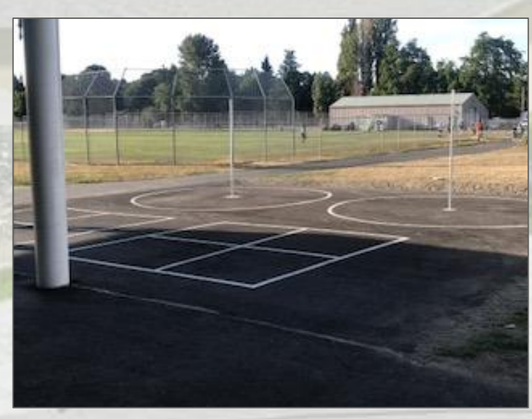
The finished pad

New 4 Square and Tetherball Court A 52X52 foot area was excavated and paved near the location of the old IT portable (north of the Yellow Gym covered area) to make way for a new four square and tetherball court. This provides age appropriate play space for the younger students at WMS