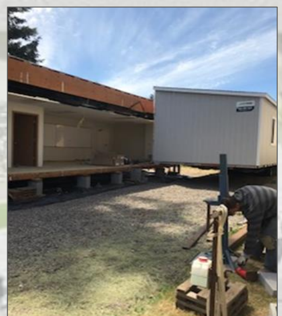
Positioning the first portable

The new portables were delivered 26 June, 3 days after school let out. The site was prepped before their arrival for electrical, data, simplex, sewer, water and fire safety. After the buildings were positioned, the following weeks included carpet install, installation life safety devices, furniture, ramps, projectors and final utility terminations. Final occupancy permit was received 7 days prior to kids arriving. The teachers added their personal touches and created fantastic spaces for our kids to thrive.