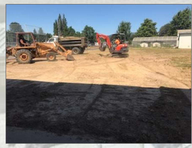
Excavation of the area